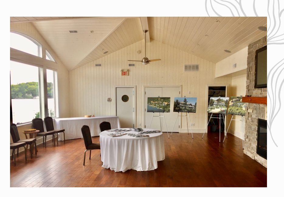
Book your event and recieve special room rates and exclusive use of amenities on site!